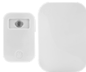
36237 Indoor Dusk to Dawn Lighting Control