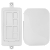
36240 Indoor Single Outlet Lighting Control