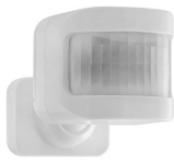
39767 Indoor Motion Sensing Lighting Control