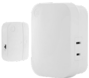
58617 Indoor Door Entry Lighting Control, 3PK