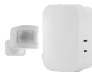
36235 Indoor Motion- Activated Lighting Control