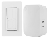
37781 Indoor Dimming Single Outlet Lighting Control