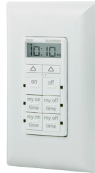
myTouchSmart Timer (In-wall) Model #26893

The myTouchSmart In-wall Timer provides easy-set controls if your receptacle is controlled by a switch.