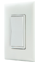
GE Bluetooth Smart Switch (In-wall) Model #13869

The GE Bluetooth In-wall Smart Switch provides the same Bluetooth control if your receptacle is controlled by a switch.